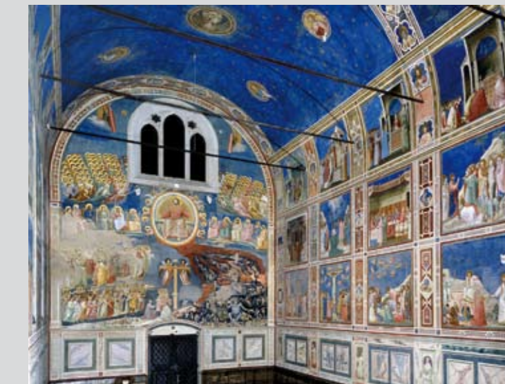
Scrovegni Chapel - The Last Judgement

On February 6 2000, Padua celebrated the 7th centenary of the acquisition of the Arena and the beginning of construction work at the Scrovegni Chapel. Since then, and throughout the decade, Giotto's message has been and will be proposed to the world once again. That blue still evokes the common origin of mankind: it certainly conveys something to the Chinese, for whom blue is a symbol of immortality; to the Europeans, who see it as the victory of Humanism over Rationalism; to the Arabs, for whom blue is the colour of happiness; to the native American peoples, who associate blue to existence animated by moral values. Sky blue, like the blazing of unexpected scientific discoveries.