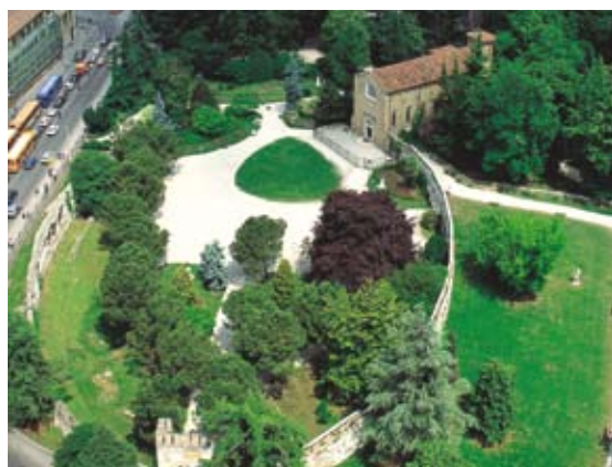
Roman Arena and Scrovegni Chapel