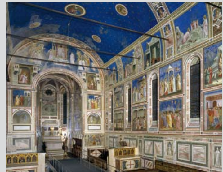
Scrovegni Chapel - Arch: Annunciation

The chapel (m 21.50x8.50x12.80), dedicated to St. Mary of the Charity (i.e., love of God and mankind), was frescoed with the following layout: 1) Scenes taken from the life of Mary (top register, near the presbytery); 2) Scenes taken from the life of Christ (second and third registers);