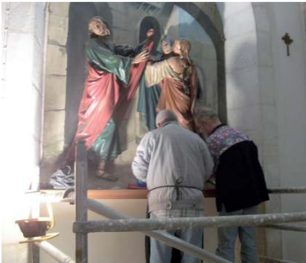
The restorers at work

Before they left, they spent their last few days repairing a tri-dimensional altarpiece of papier-mâché made by the sculptor from Lecce Salvatore Sacquegna in 1914 and preserved at the Sanctuary of the Condemnation. The artwork was showing some wear and tear but it had also been further damaged on the accessible parts by the excesses of the visitors. The different stages of the restoration process were the removal of some parts due to their inadequate nature, the stabilisation, cleaning, plastering and plastic and chromatic reintegration. For now, this was just an emergency intervention as, during the course of the work, it became obvious that there was a clear need to carry out some general work on the artwork in general, which will have to be carried out at some point in the future.