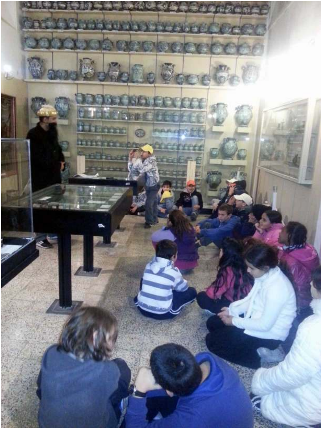
The group of children paying attention to the performance

numerous captions on the many vases at the Pharmacy, it is obvious how important an influence traditional Oriental medicine—both Jewish and Arab— had on occidental medicine. This very fact constitutes in itself a very important lesson regarding the opportunities of integration among different cultures.